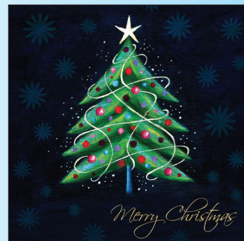
Christmas Wishes ●